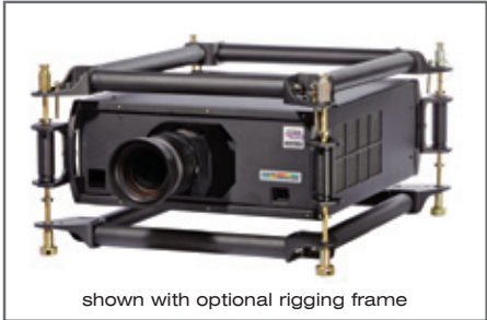
shown with optional rigging frame

Projector dimensions (mm) L1 620 W1 540 H1 258