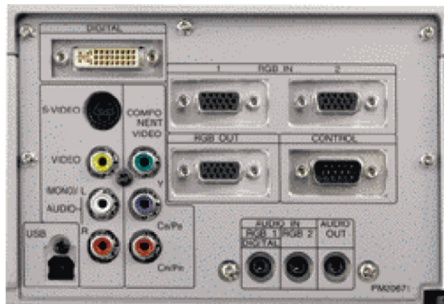
The ImagePro 8941A inputs are easily accessible.

The Dukane ImagePro™ 8941A is the ideal projector for the most demanding, large audience presentations. The eye popping 4500 lumens and XGA resolution provides you rich, detailed images. The optional long throw lens allows you the ability to handle vast distances from the projector to the screen. The 8941A is as versatile as any projector on the market today, so you can feel assured that any and all presentation demands will be easily met by the 8941A. It also has Progressive Scan to give double the video resolution with added sharpness.